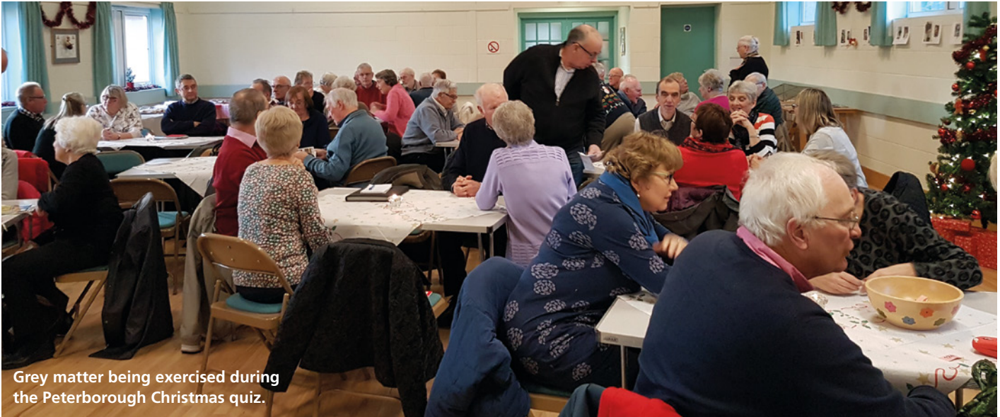
Grey matter being exercised during the Peterborough Christmas quiz.