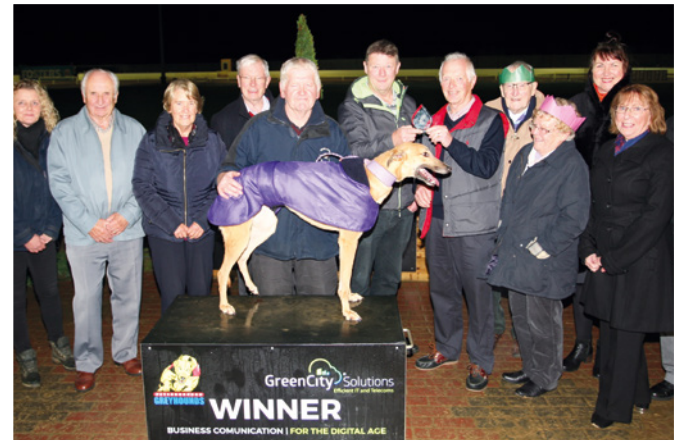
The winner of the 'Pearl Pensioners' Christmas Stakes'.

Race 10 was sponsored by the Club, and although no fortunes were won, everybody came away enriched by the experience (especially the bookmakers).