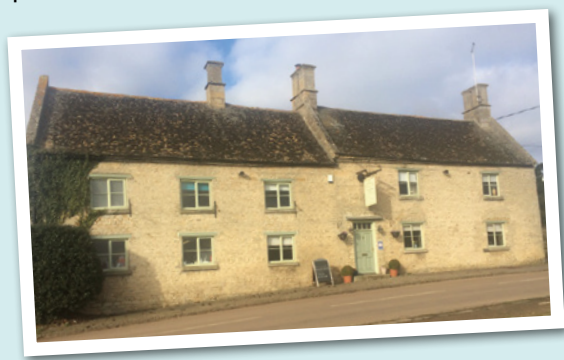
The Shuckborough Arms.

Around a dozen snooker enthusiasts gather each Monday morning to test their skills on the green baize and in late December, 17 members enjoyed Christmas lunch at the Shuckborough Arms near Oundle. Another of Terry Moon's testing quizzes crowned a thoroughly superb afternoon.