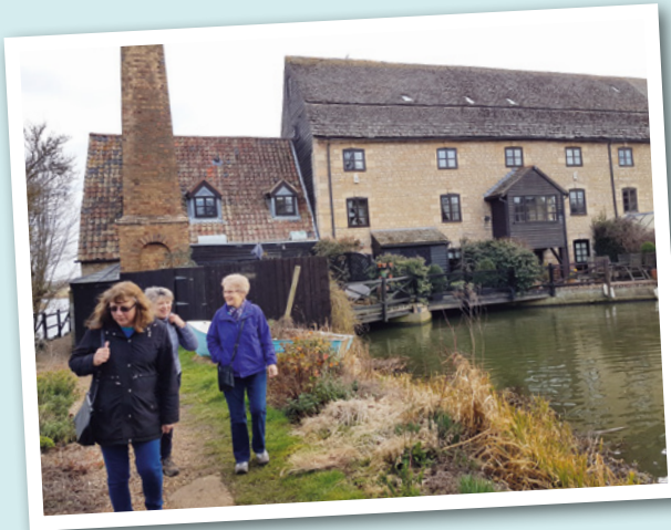
The February walk passes the delightful Water Newton Mill.

The walking society meets once a month to tackle four or five-mile romps in the countryside surrounding Peterborough; with members sharing the task of selecting the walks and (more importantly) the pubs where lunch can be enjoyed.