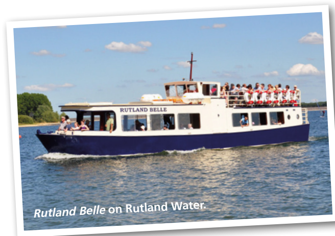
Rutland Belle on Rutland Water.