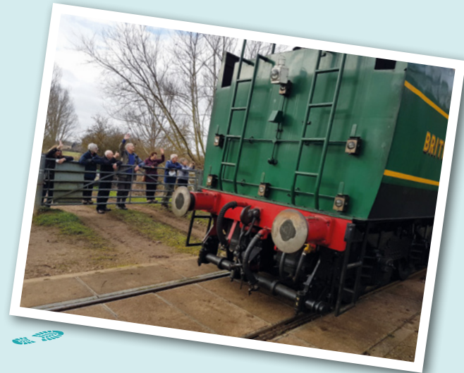
A close call as a steam train rumbles past the walkers.