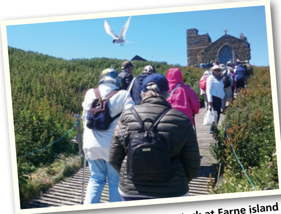
Tern attack at Farne island