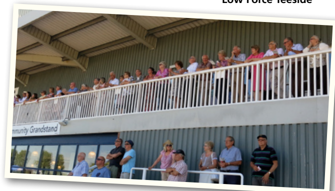
Private balcony at Southwell Race Course