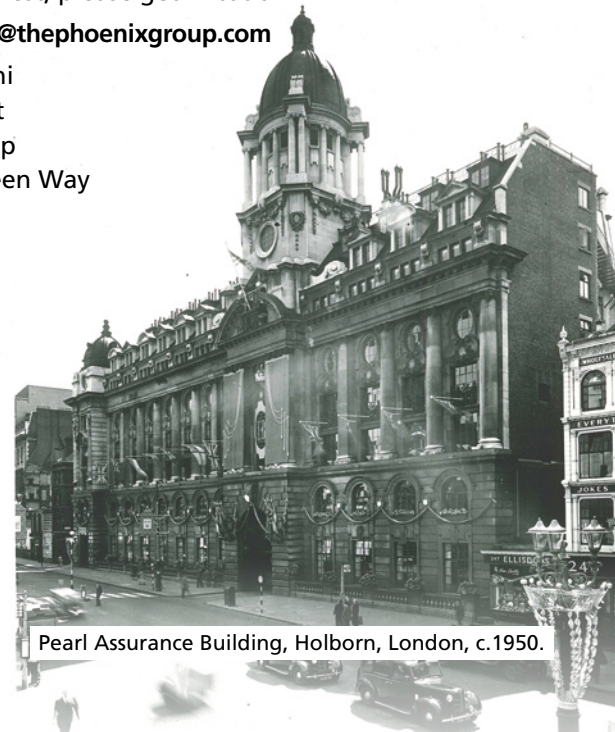
Pearl Assurance Building, Holborn, London, c.1950.

Ayah Al-Rawni Lead Archivist Phoenix Group 1 Wythall Green Way Wythall Birmingham B47 6WG