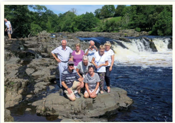
Low Force Teeside