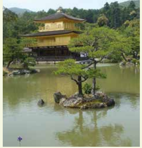
The Golden Palace in Kyoto.

and traditional bands, fortune telling and dancing were taking place. The village covers a substantial area. Traditional housing was either daub and wattle with straw roofing, wooden, or stone with what appeared to be carved slate similar to those you see in pictures of the Forbidden City in Peking.