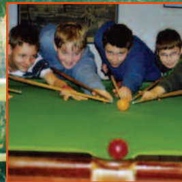
Still on the ball page 3