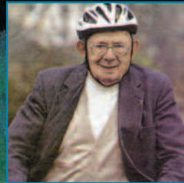
Still on his bike page 2