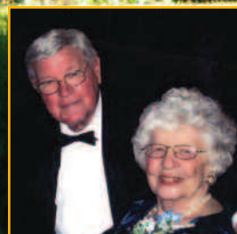
Diamond wedding celebration page 6