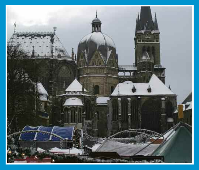
Christmas market in the historic centre of Aachen.

Our first trip of the year will be to the Suffolk Coast and we hope to be able to report on that in the next issue.