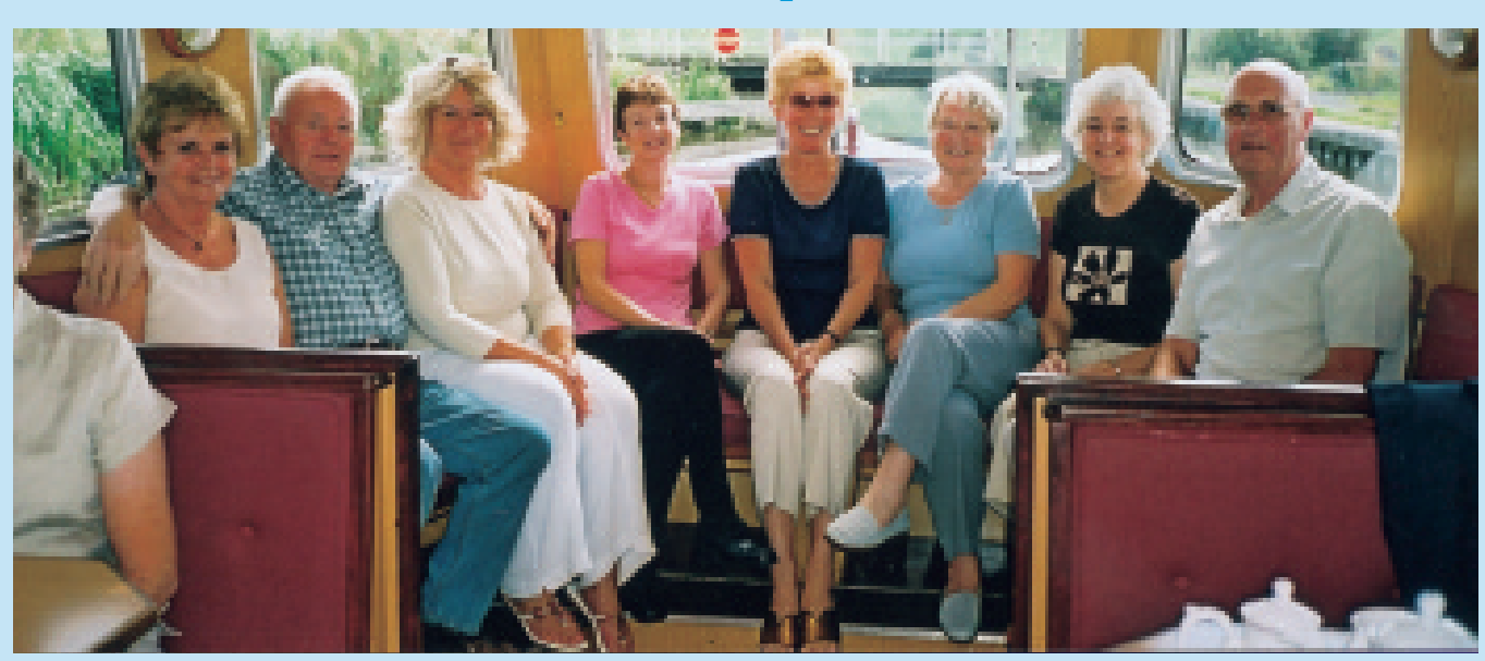
Last August, 50 of our members had a fabulous day when they took a canal boat trip from Skipton in the Yorkshire dales. The scenery was stunning and the boat crew looked after all our needs to make it a day to remember.